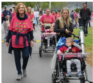
October 7, 2017 was a great day for a stroll! SEE PAGE 4