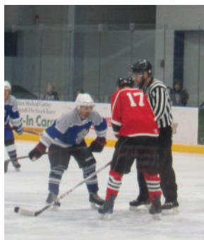
Fun on ice with the Battle of the Badges! SEE PAGE 5