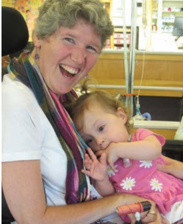
Cedarcrest Champions Recognized! See page 5.